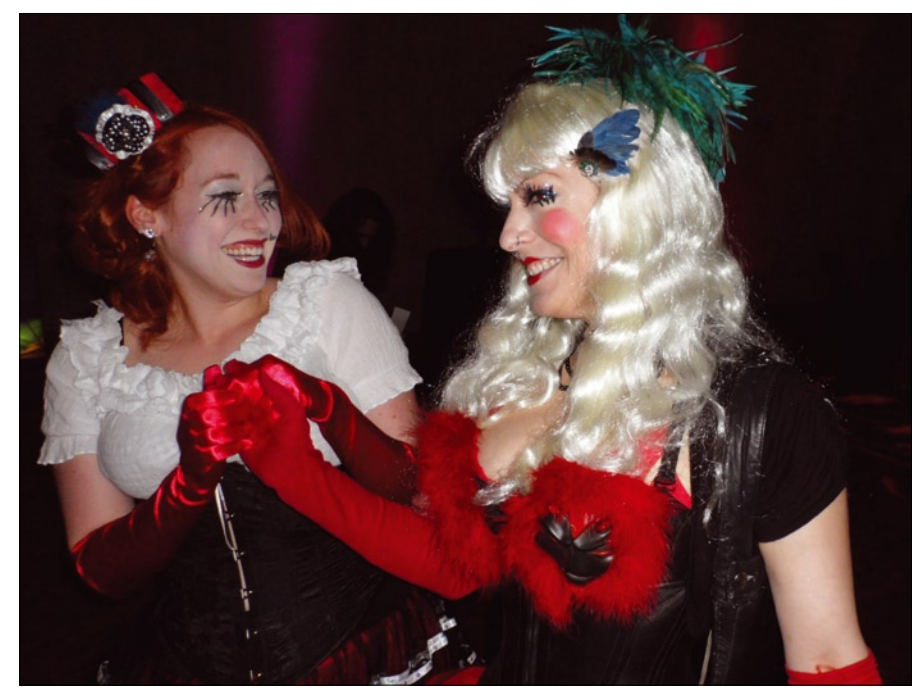
Figure 4: Google's party raised a few eyebrows.

WWW.UBUNTU-USER.COM UBUNTU USER ISSUE 13 35